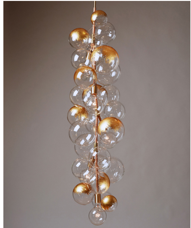
Pictured with Satin Brass Natural Leather Cord and mix of 24k Gilded and Clear Globes