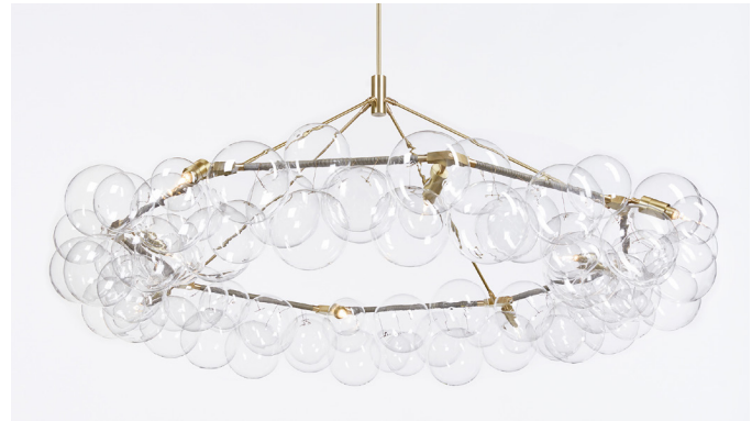
Pictured with Satin Brass and Gray Leather Cord