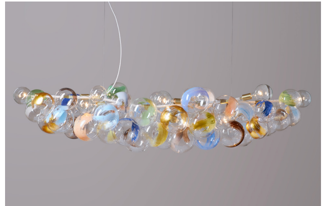
Pictured with Satin Brass, Natural Cotton Cord and Hand-painted Strokes Finish, Figure 1 suspension configuration